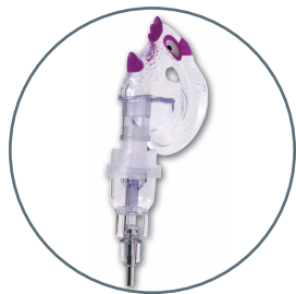
VixOne w/Dragon Mask

* Reference (Hest Vol. 110, p.498-505 August 1996)